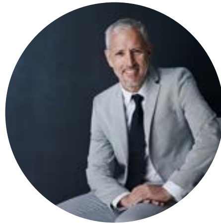
John Doe, CEO of Tech Innovators, USA

"DCS has been instrumental in transforming our IT infrastructure. Their expertise in AI and cybersecurity has significantly enhanced our operational efficiency and security measures. Highly recommend their services!"